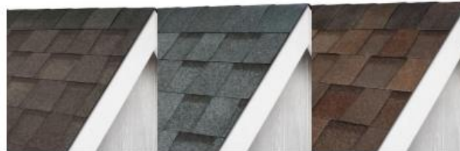
Driftwood SRI 18 Coastal Cliffs SRI 17 Coral Canyon SRI 17

Pinnacle® Sun shingles are more than just a cool roof solution. With the incorporation of both 3M™ Scotchgard™ Protector and reflective granules, Pinnacle® Sun shingles offer a complete roofing system that not only keeps your home cool, but also fights against unsightly algae growth that can hinder the reflective abilities of the shingles over time.